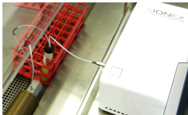
Figure 1: Sionex DMS with connected breeding ground and filter

The headspace of MAP in vitro cultures (n=8) was analyzed 1,2,3,4 and 6 weeks after inoculation with a GC-differential-ion-mobility-spectrometer (SIONEX). For comparison, different culture media with no bacterial growth (n=12) were included (pure(Aa), sterile-filtered(Ba), heat-inactivated(Ca)). Headspace was collected with a disposable PTFE tube and the drawn room air was filtered with a multi-stage filter (Figure 1). The spectra were analyzed by a statistical program based on cluster analysis.